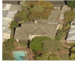
Aerial view.