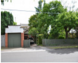
5 Stephen Street, Newtown