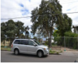
7 Stephen St, Newtown