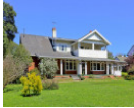
'Bryn-Teg' prior to demolition.