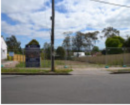
9 Stephen St, Newtown