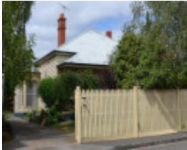
14 Stephen Street, Newtown