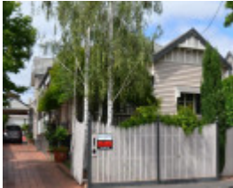
16 Stephen Street, Newtown