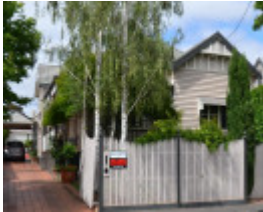
16 Stephen Street, Newtown