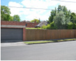
17 Stephen St, Newtown