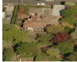
Oblique aerial.