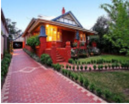
Domain online, February 2009.