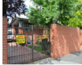
18 Stephen Street, Newtown