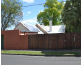
19 Stephen Street, Newtown