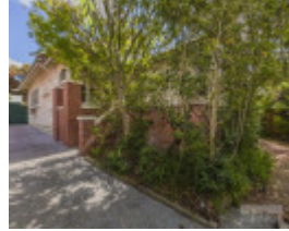
Whitford Real Estate at realestate.com.au