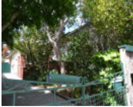
20 Stephen Street, Newtown