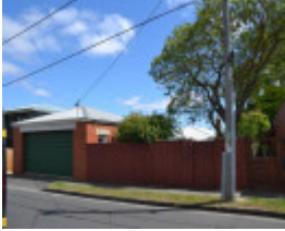
21 Stephen Street, Newtown