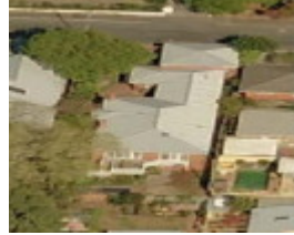
Aerial view.