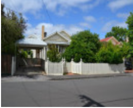
22 Stephen Street, Newtown