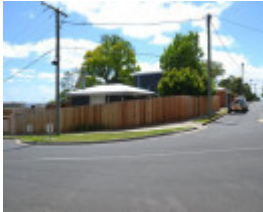
23 Stephen Street, Newtown