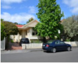
24 Stephen Street, Newtown