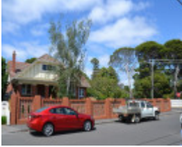
32 Stephen Street, Newtown