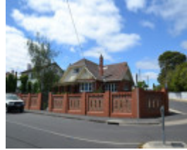
32 Stephen Street, Newtown