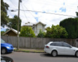
5A Stephen Street, Newtown