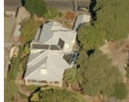
Aerial image.