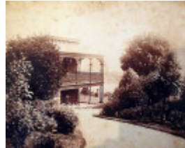
'Newtown Brae', n.d. [c.1900]