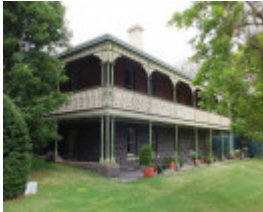
15 Stephen Street, Newtown