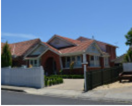
118 Aphrasia Street, Newtown