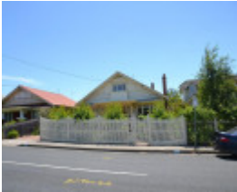
124 Aphrasia Street, Newtown