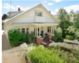
124 Aphrasia Street. www.realestate.com.au