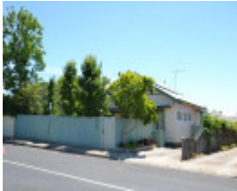
128 Aphrasia Street, Newtown