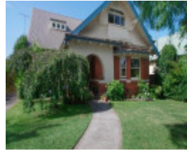
Dwelling, 130 Aphrasia St, https://www.realestate.com.au/property/130-aphrasia-st-newtown-vic-3220