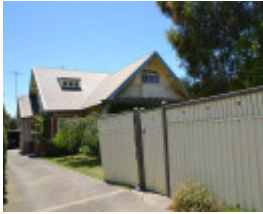
130 Aphrasia Street, Newtown