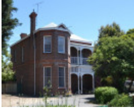
132 Aphrasia Street, Newtown