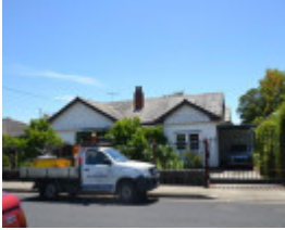
136 Aphrasia Street, Newtown