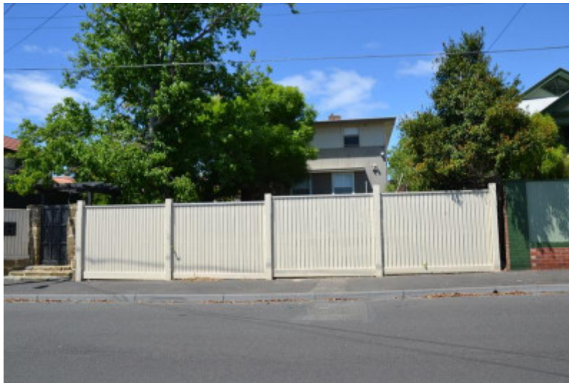
2 Nantes Street, Newtown