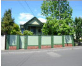
4 Nantes Street, Newtown