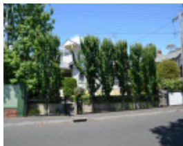
6 Nantes Street, Newtown