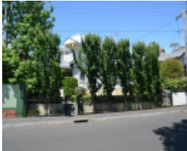
6 Nantes Street, Newtown