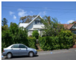
14 Nantes Street, Newtown