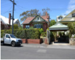
16 Nantes Street, Newtown