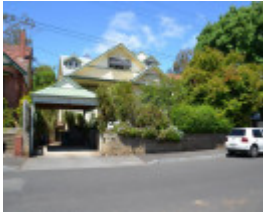
18 Nantes Street, Newtown