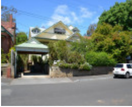
18 Nantes Street, Newtown