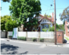
20 Nantes Street, Newtown