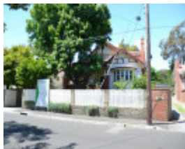
20 Nantes Street, Newtown