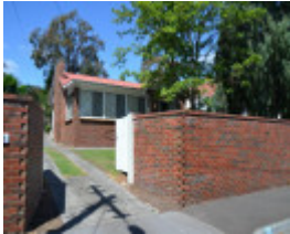
22 Nantes Street, Newtown