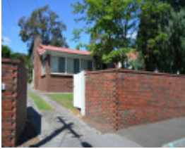
22 Nantes Street, Newtown