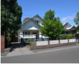
24 Nantes Street, Newtown