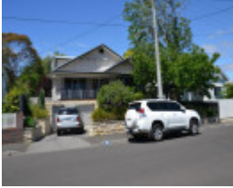
26 Nantes Street, Newtown