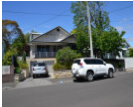
26 Nantes Street, Newtown