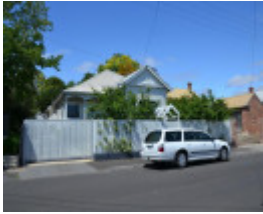
28 Nantes Street, Newtown