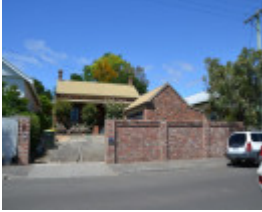
30 Nantes Street, Newtown