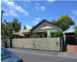
32 Nantes Street, Newtown