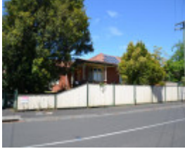
303 Shannon Avenue, Newtown