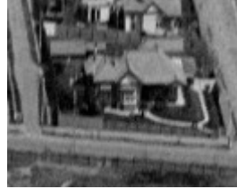
'Comara', October 1927. Pratt, La Trobe Picture collection, State Library of Victoria, H91.160/911.