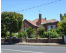
315 Shannon Avenue, Newtown