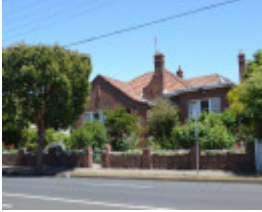
315 Shannon Avenue, Newtown