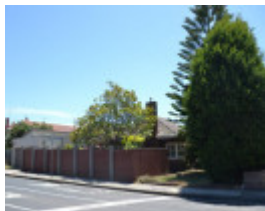
319 Shannon Avenue, Newtown