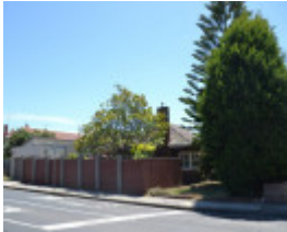
319 Shannon Avenue, Newtown