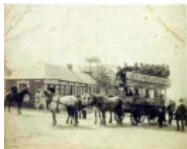
Fernery Hotel, c.1890. Massingham, Geelong Library & Heritage Centre collection, GRS 2009/1133.