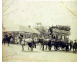
Fernery Hotel, c.1890. Massingham, Geelong Library & Heritage Centre collection, GRS 2009/1133.