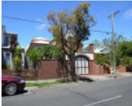
1 Upper Skene Street, Newtown