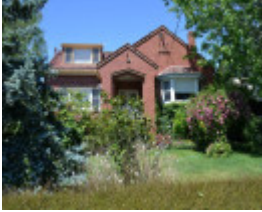
5 Upper Skene Street, Newtown