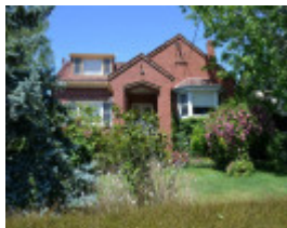
5 Upper Skene Street, Newtown