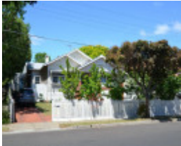
9 Upper Skene Street, Newtown