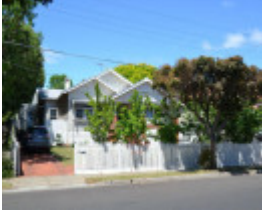
9 Upper Skene Street, Newtown