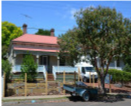
11 Upper Skene Street, Newtown