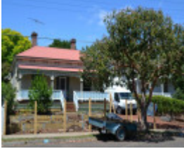
11 Upper Skene Street, Newtown