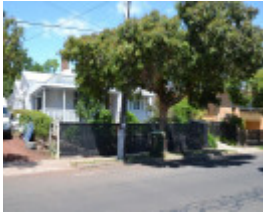
13 Upper Skene Street, Newtown