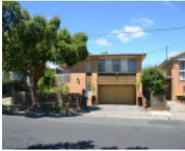
15 Upper Skene Street, Newtown