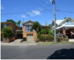
17 Upper Skene Street, Newtown