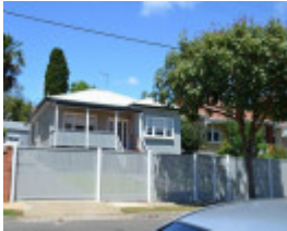
21 Upper Skene Street, Newtown