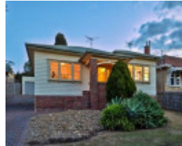
Dwelling before alterations, 2013.