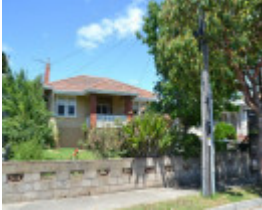
23 Upper Skene Street, Newtown