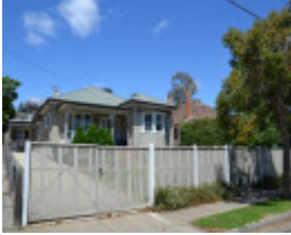
25 Upper Skene Street, Newtown