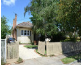
27 Upper Skene Street, Newtown