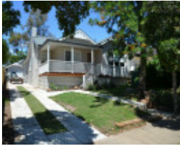
29 Upper Skene Street, Newtown